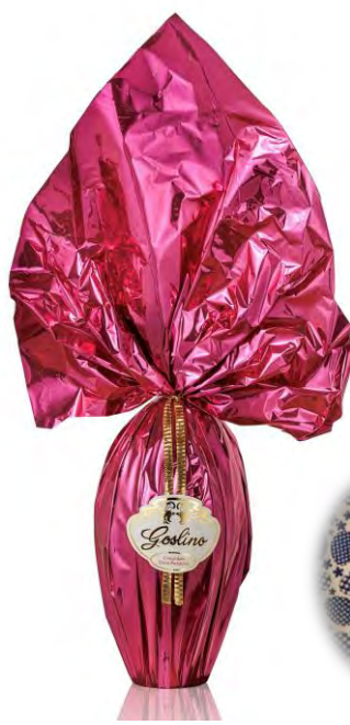
L213 Dark Chocolate Eggs 1*7000

Images for illustration purposes only. Colours may vary. Cases will comprise of assorted colours as indicated