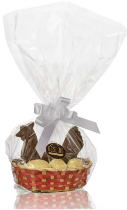
L77 Milk Chocolate Hens 6*320g