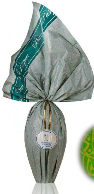
L522 Milk Chocolate Eggs 10*350g