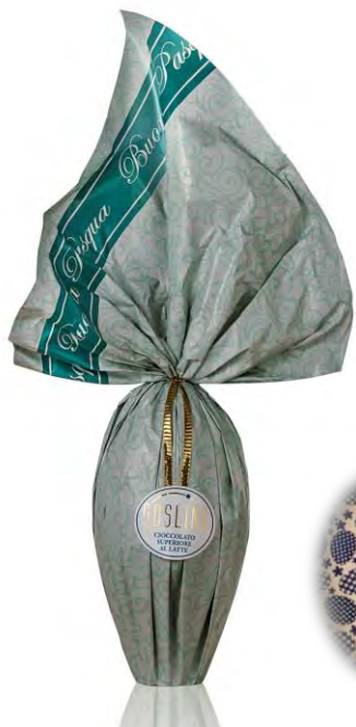
L525 Milk Chocolate Egg 1*1000g