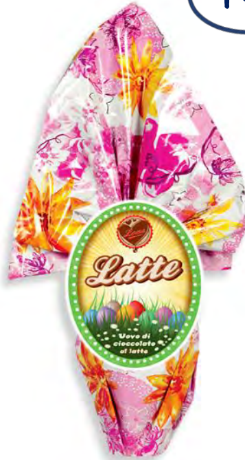
5001 Milk Chocolate Eggs 13*280g