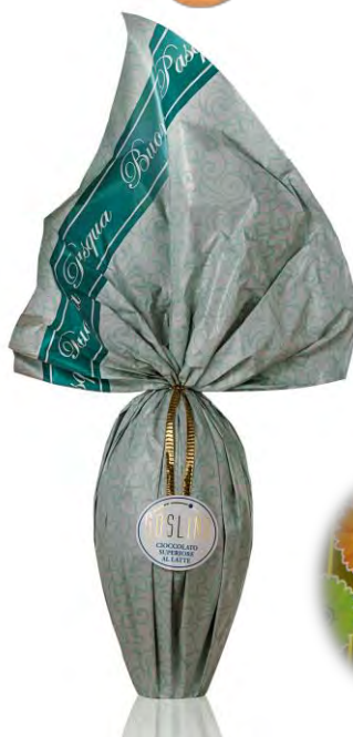
L205 Milk Chocolate Egg 1*2000g