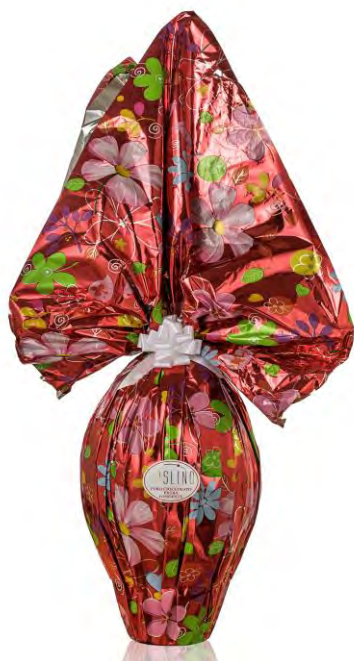
F212 Dark Chocolate Egg 1*4000g