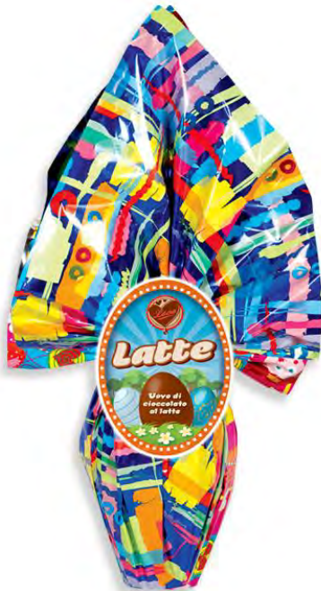
5003 Milk Chocolate Eggs 7*550g